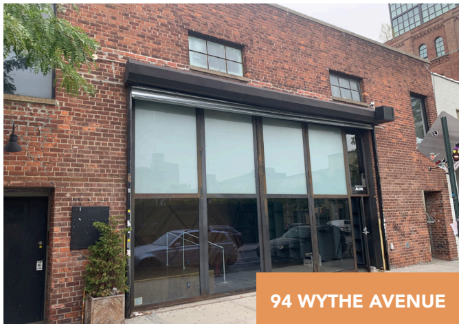
94 WYTHE AVENUE