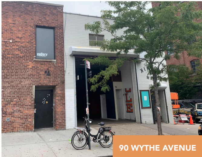
90 WYTHE AVENUE