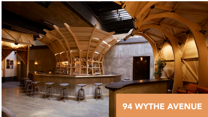
94 WYTHE AVENUE