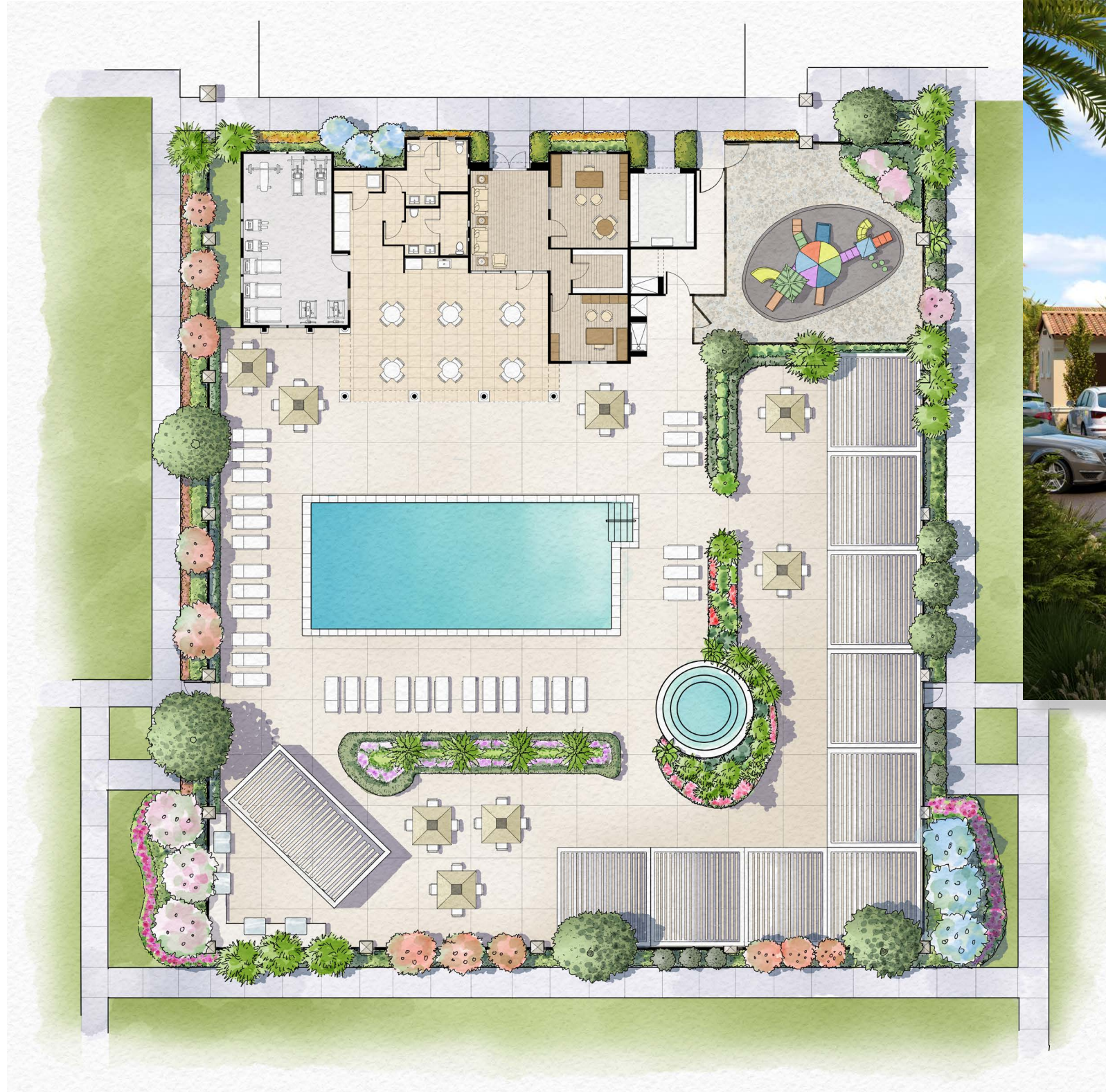
Clubhouse & Amenity Center