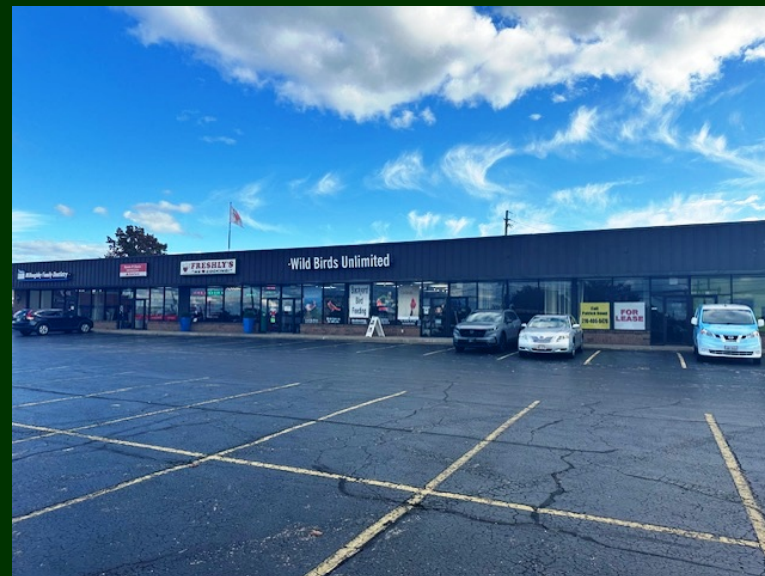
34500 Euclid Ave., Willoughby, OH

No warranty or representation, express or implied, is made as to the accuracy of the information contained herein. It is submitted subject to errors, omissions, price changes, rental or other conditions, withdrawal without notice, and to any special listing conditions imposed by our client.