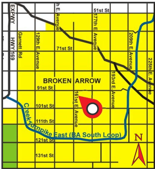
Greater Tulsa Area Map

SPACE FOR LEASE! 2005 S. Elm Pl. Broken Arrow, OK