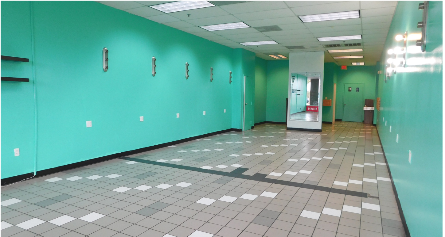
In-Line Retail Suite - Hair Salon - Suite 108 - 1,100 SF