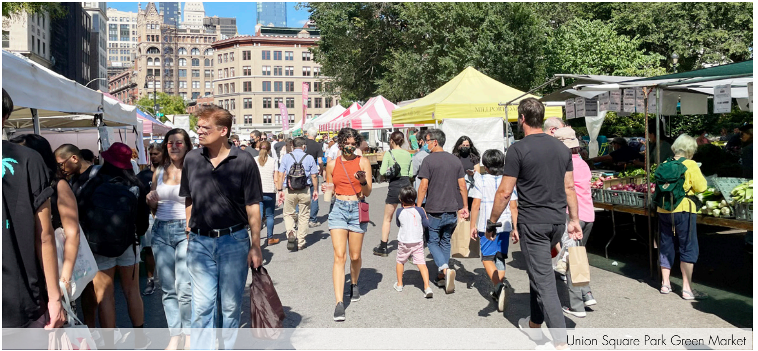
Union Square Park Green Market

ABS Partners Real Estate, as the exclusive agent is pleased to offer the following opportunity for lease: