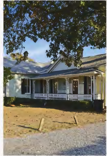
A Legacy Address in Pensacola's Historic Core