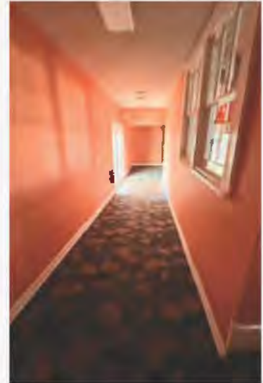
Flexible rooms suitable for offices, meeting spaces, or showroom use