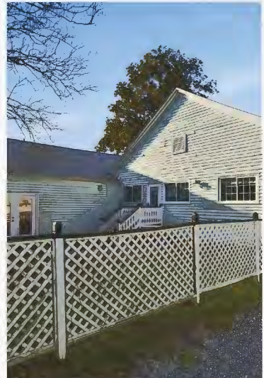
Historic Significance & Neighborhood Character