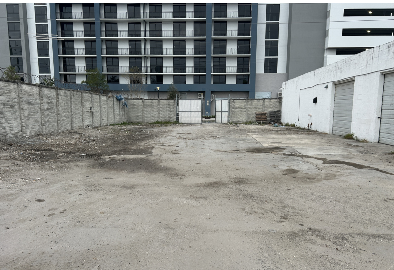
618 NW 6th Ave - Yard Entrance