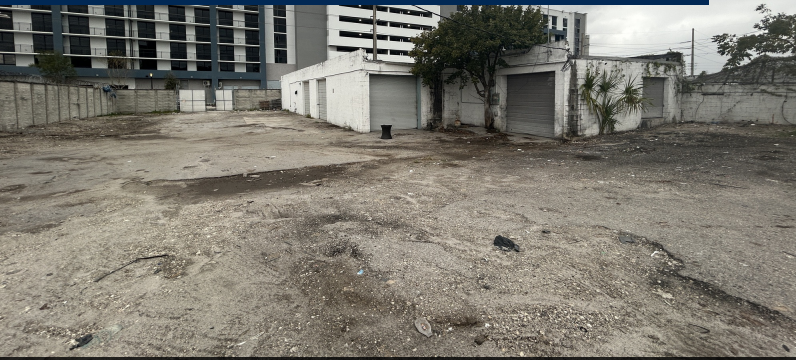
618 NW 6th Ave - Warehouse Loading