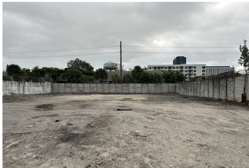
618 NW 6th Ave - Storage Yard