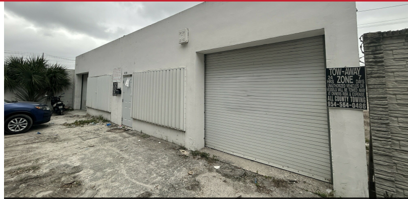
618 NW 6th Ave - Warehouse Front