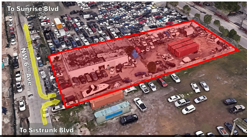
618 NW 6th Ave - Aerial