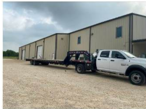
Exterior View of Subject