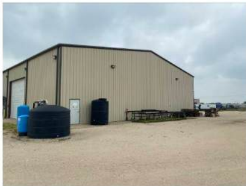
Exterior View of Subject