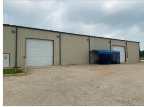
Exterior View of Subject