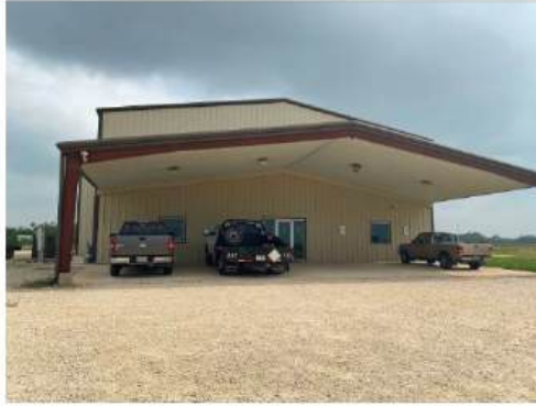
Exterior View of Subject