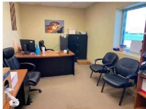
Interior View of Subject