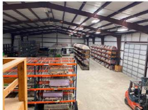
Interior View of Subject

Flatrock Commercial Real Estate Group 20445 State Hwy 249 | Suite 470 | Houston TX 77070 | Main: 713.574.6433 | flatrockcompanies.com