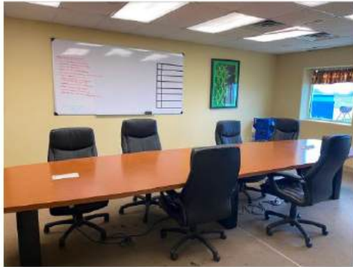
Interior View of Subject