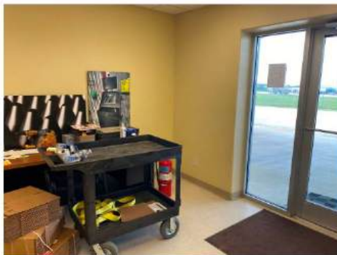
Interior View of Subject