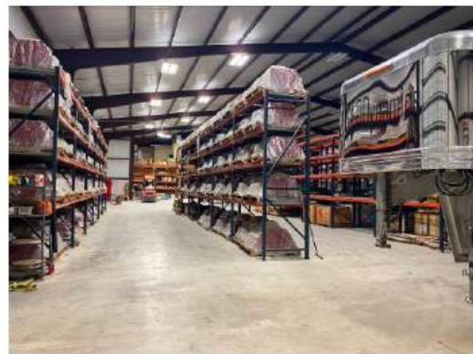
Interior View of Subject