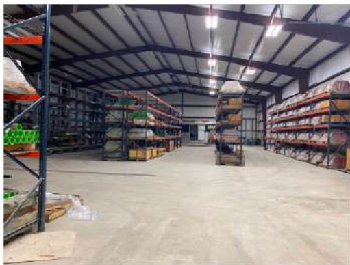
Interior View of Subject