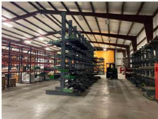
Interior View of Subject