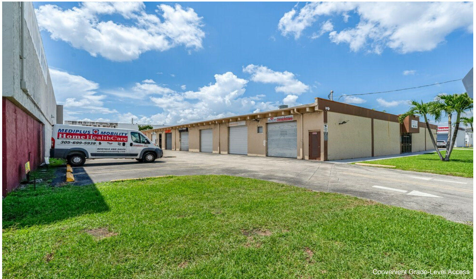
Convenient Grade-Level Access