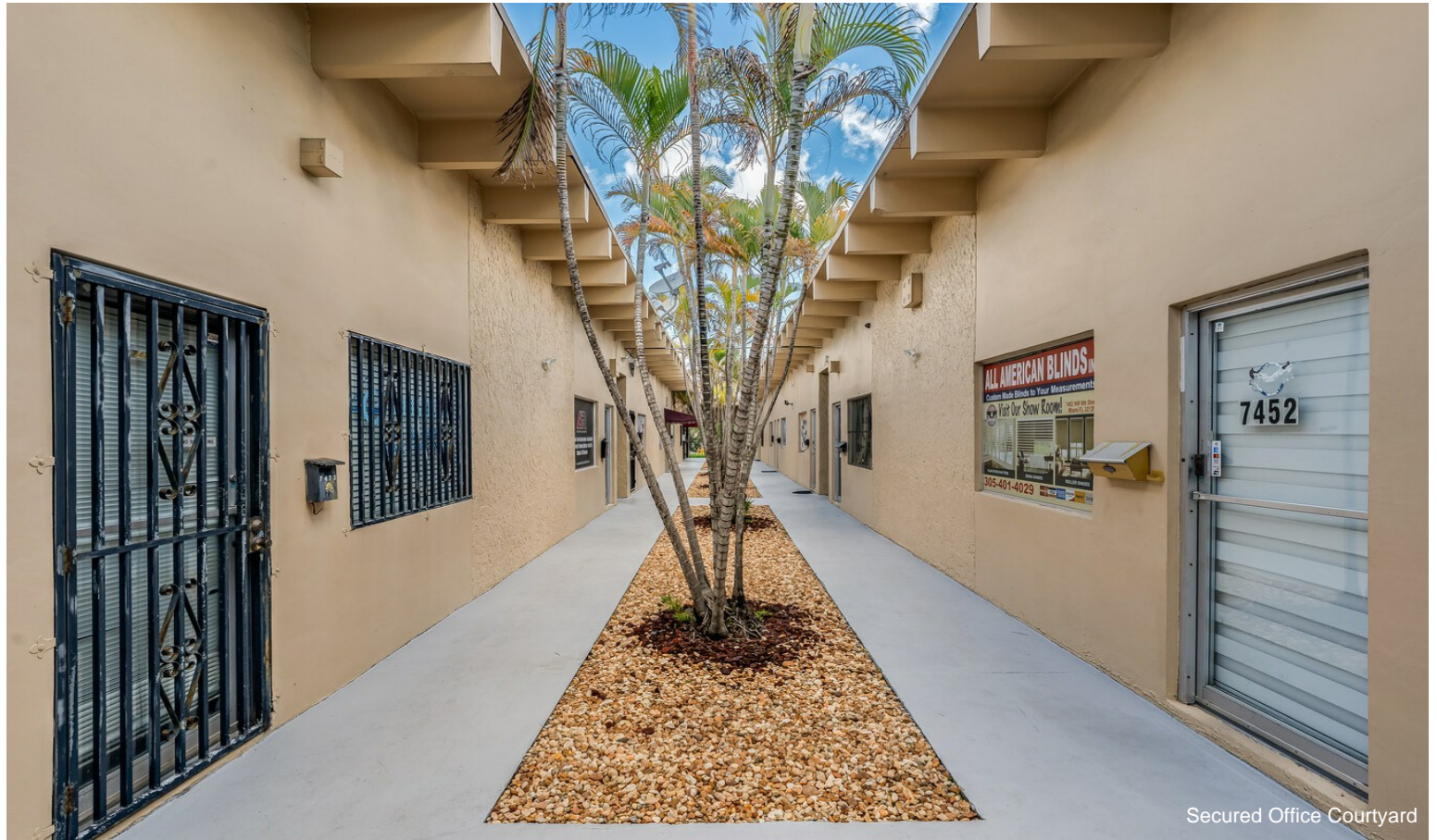
Secured Office Courtyard