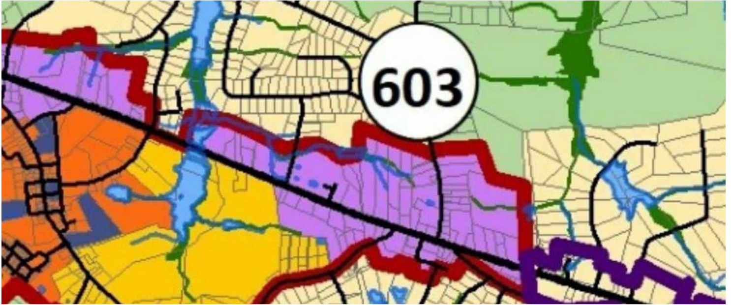
2021 Powhatan County Comprehensive Plan - Gateway Business