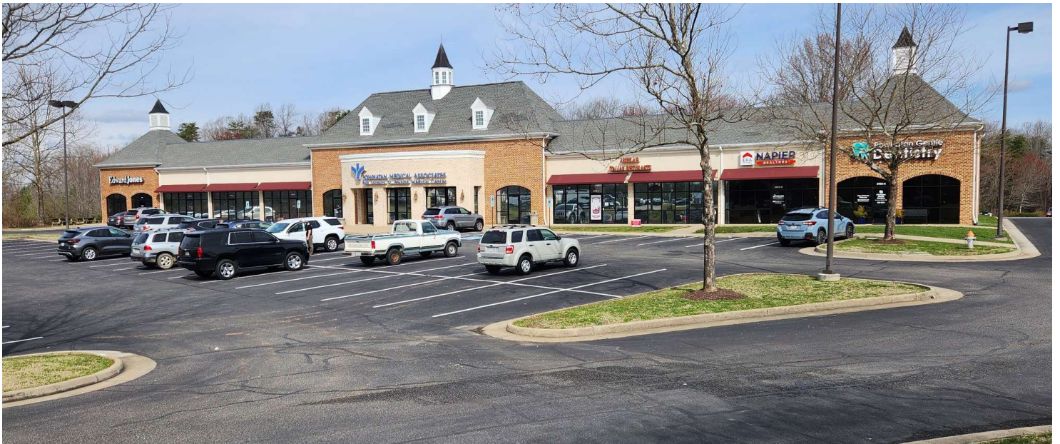
The Maxey Center