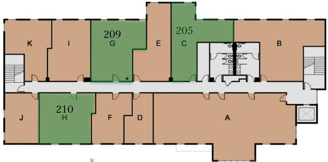
Building "D" Plan Second Floor N.T.S.