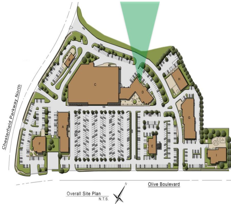
Overall Site Plan N.T.S.