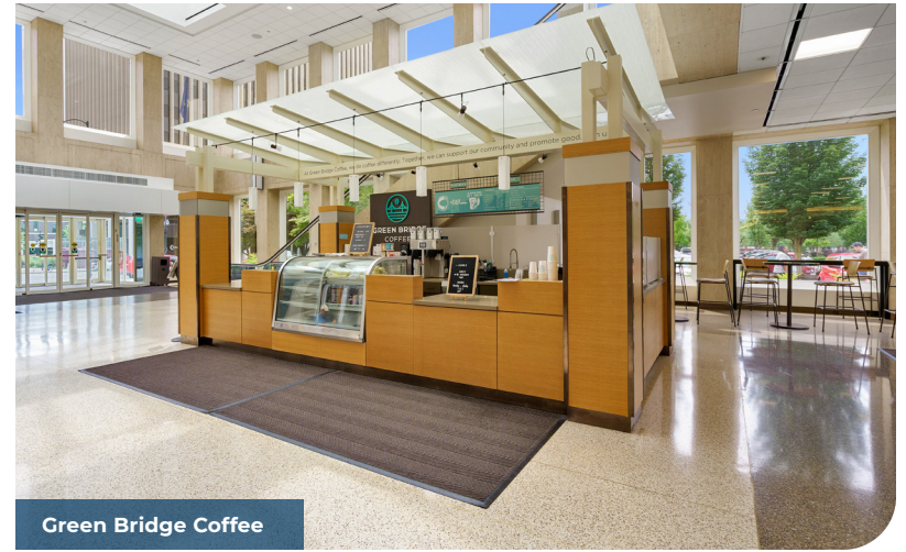
Green Bridge Coffee