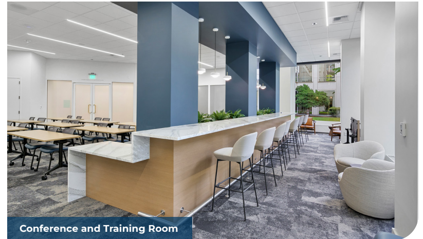
Conference and Training Room