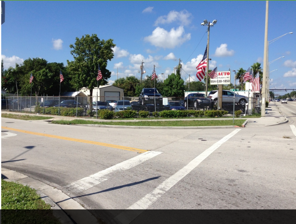
Corner view looking NE