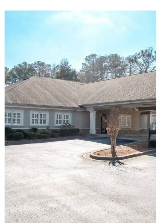
516 W Bankhead Hwy 516 W Bankhead Hwy, Villa Rica, GA 30180