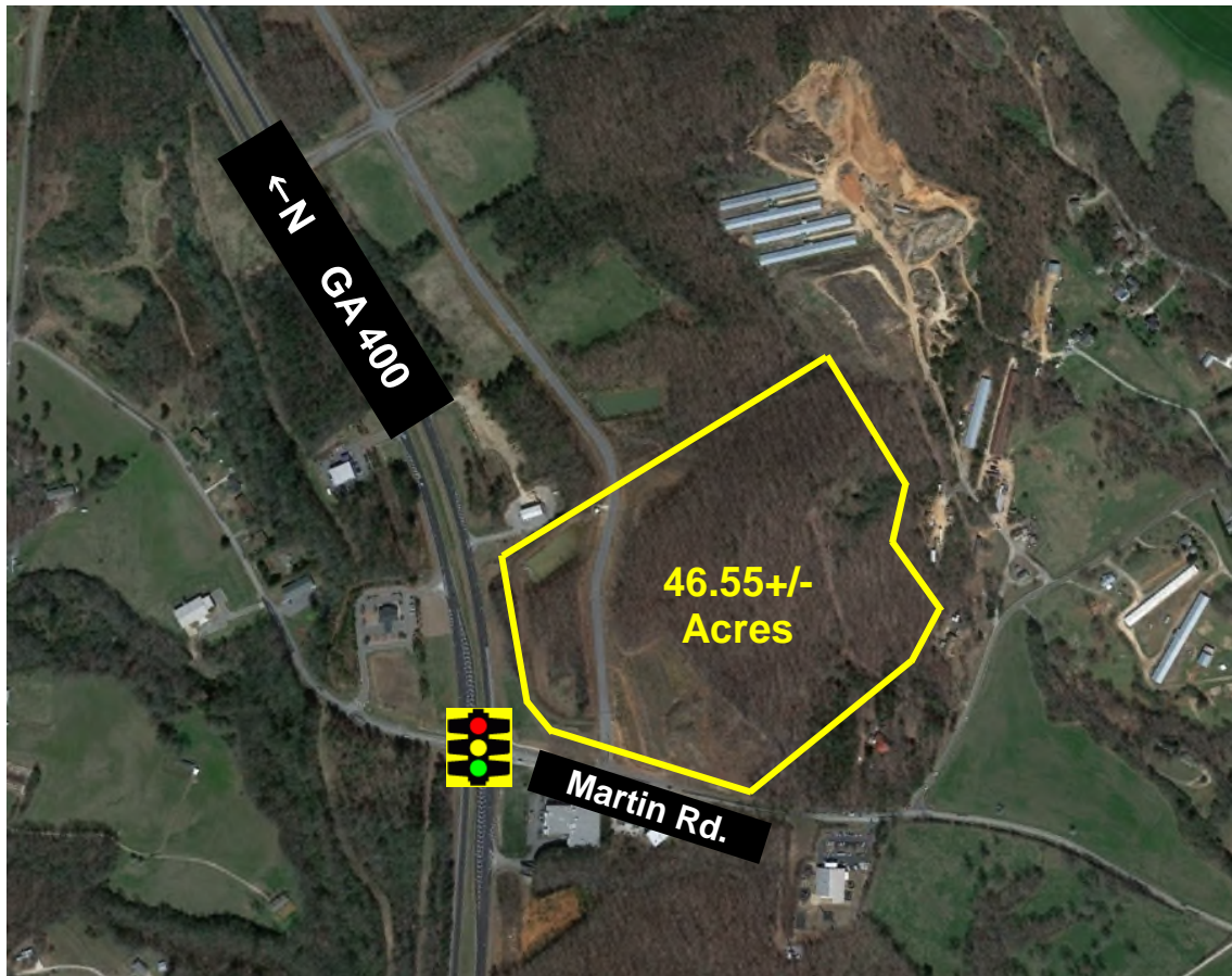
Martin Road at GA 400, Cumming, GA 30041