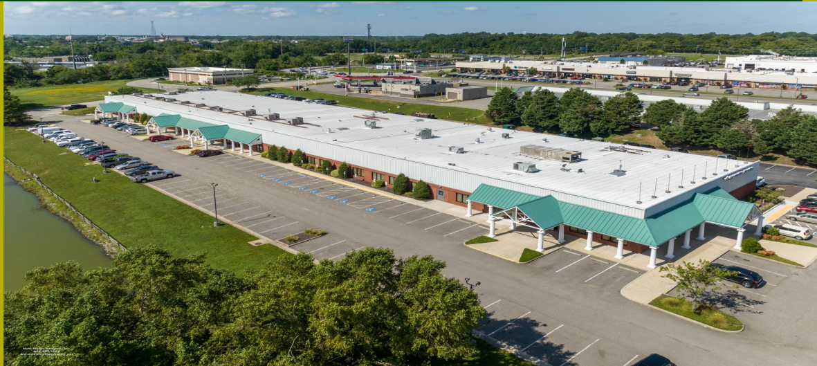
Southlake 930 South Avenue Suite 6 - 9 10,000 Square Feet Colonial Heights, Virginia