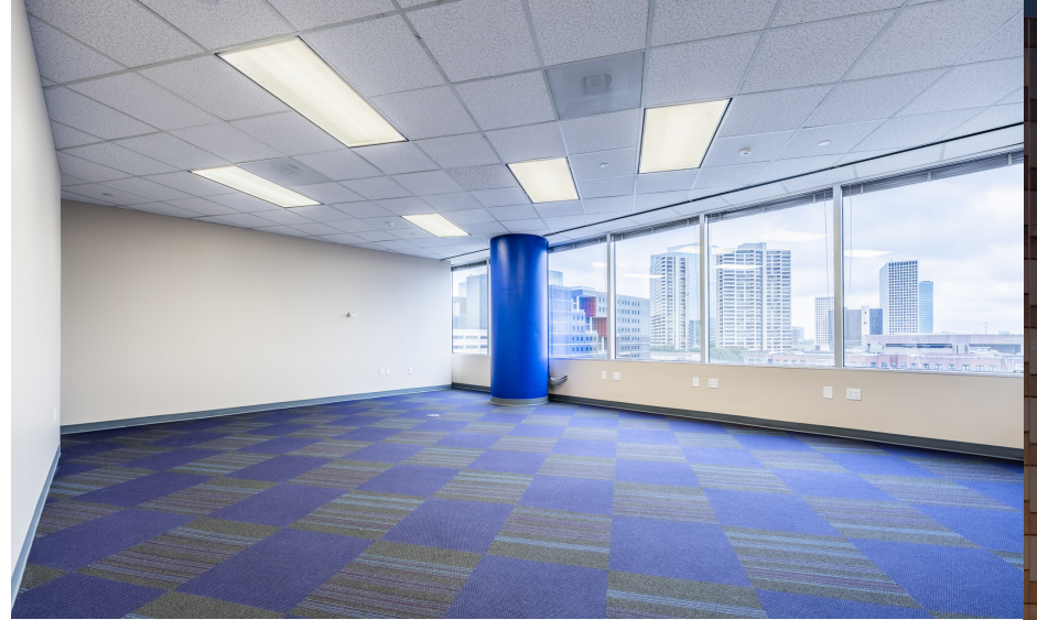
Open concept plan with 2/3 height glass and dramatic views