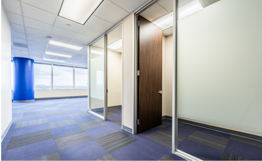
Private internal call rooms with full glass walls and privacy film