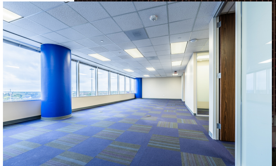
Floor jacks in place for plug and play open plan configuration