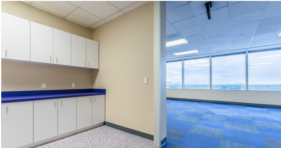
Efficient work area maximizes collaborative space while still allowing for file and copy work