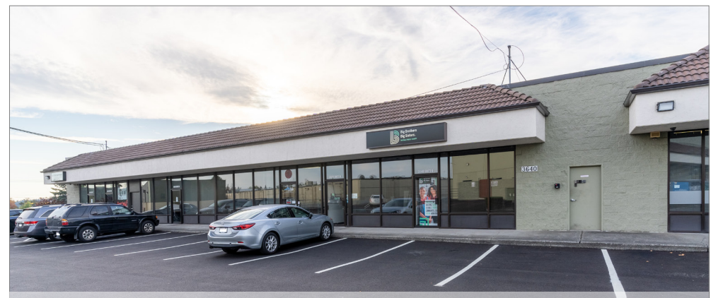
Building D - Top Level (3640)

The information provided herein has been obtained from sources believed to be reliable, but no representation or warranty, express or implied, is made with respect to the accuracy or completeness of any such information. Each prospective buyer or tenant should independently investigate, evaluate and verify all information provided herein and any other matters deemed material. Please consult your attorney, tax advisor or other professional advisor. The terms of sale or lease set forth herein are subject to change or withdrawal at any time and without notice.