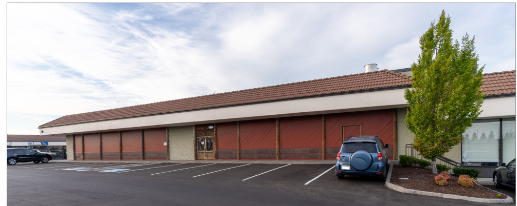
Building A (3630)