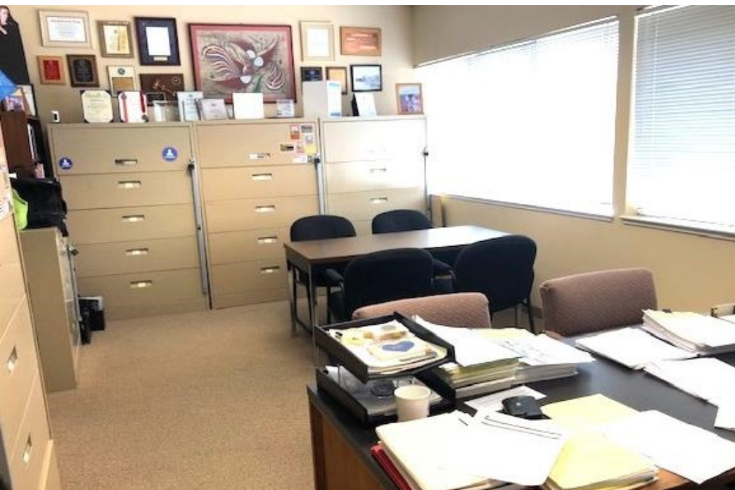
Suite 375 Office