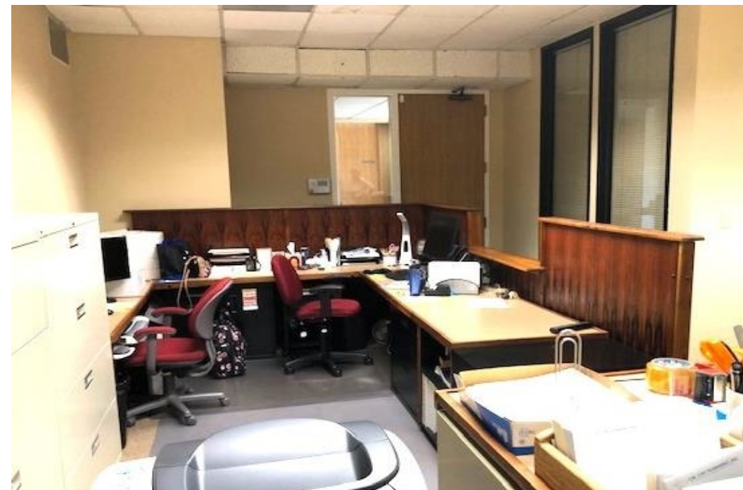
Suite 375 Interior