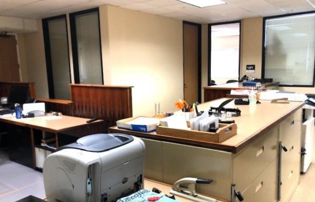
Suite 375 Interior