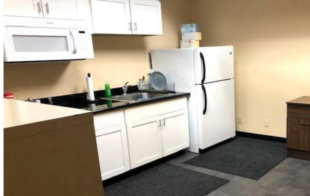
Suite 375 Kitchenette