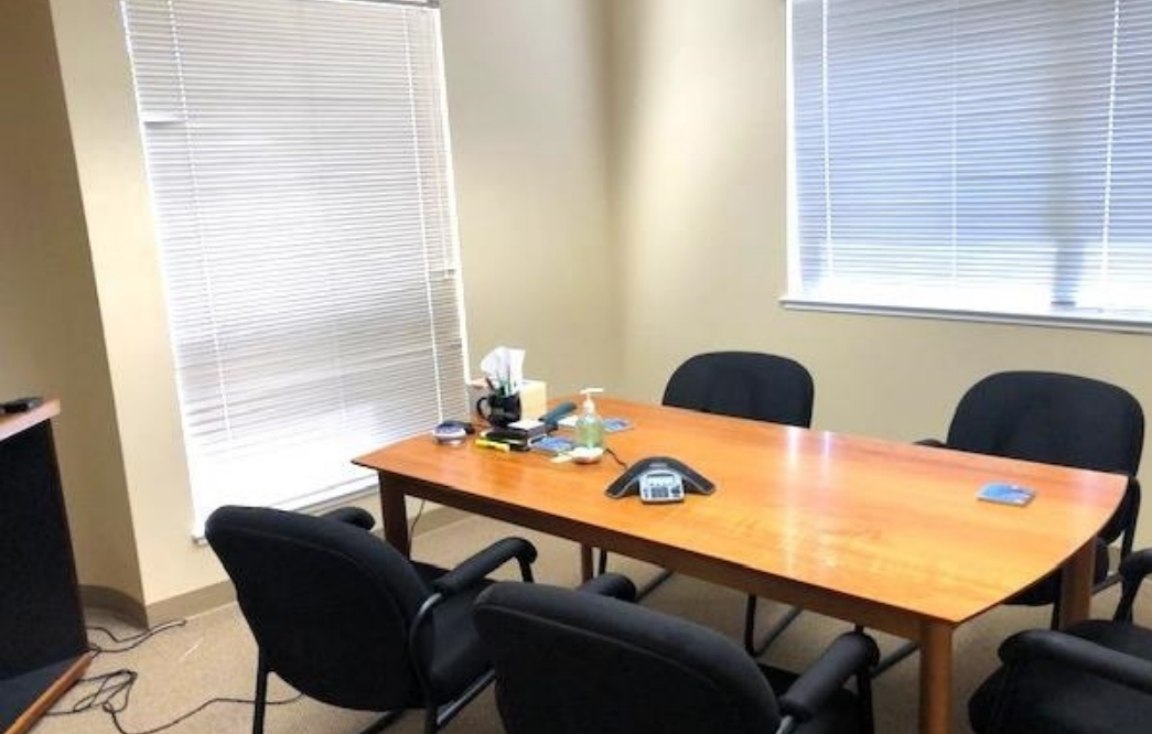
Suite 375 Office