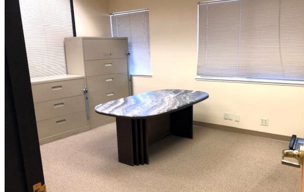
Suite 375 Office