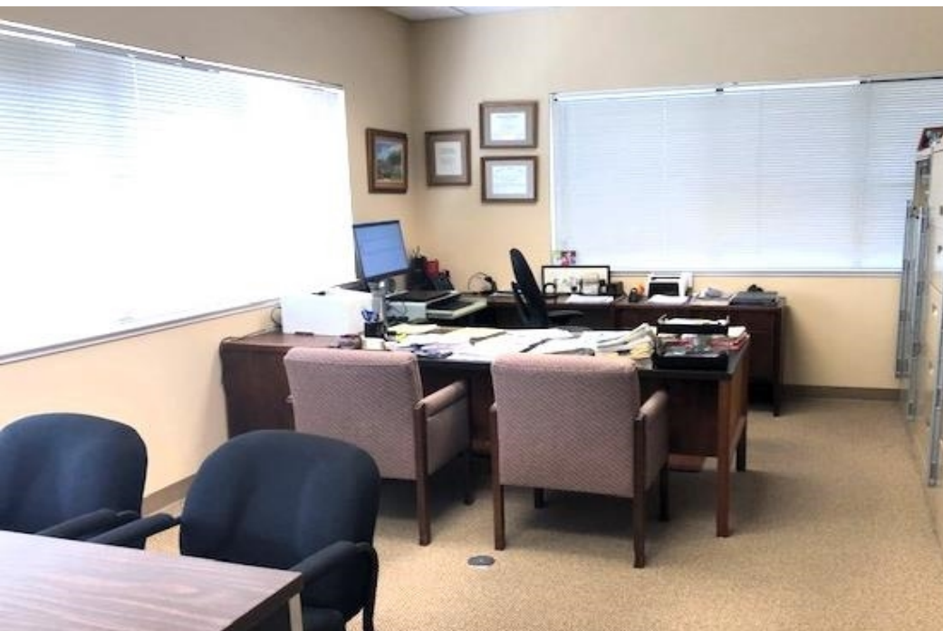
Suite 375 Office