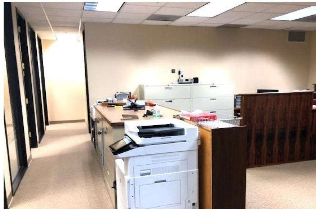
Suite 375 Interior