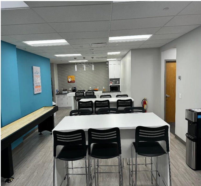
Break Area & Kitchenette