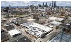
SoNo Philadelphia, PA

Website: http://www.delcologisticscenter.com/