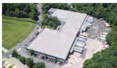
401 Domino Lane Philadelphia, PA

150,000 sf industrial building acquired 2019 and 100% leased to an e-commerce company.