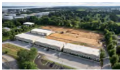
3900 Columbia Avenue Linwood, PA

Link to time lapse video: https://m.youtube.com/watch?v=Vo6l3VBglhs