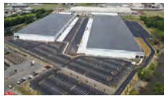
Delco Logistics Center Eddystone, PA

770,000 SF "spec" industrial development project; acquired in 2018 and completed in 2022. Largest spec industrial development project in Delaware County.