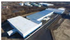
175 DeRousse Avenue Pennsauken, NJ

130,000 SF industrial building acquired in 2018. After a short leaseback from the Seller, Alliance completed base building improvements and leased the Property to Philabundance under a long-term lease.