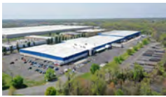
1 & 2 Geoffrey Drive Fairless Hills, PA

In December 2021, Alliance acquired a 405,000 SF Class B industrial building with an adjacent 60,000 SF manufacturing building. After the existing tenant vacated, Alliance leased the warehouse building to a leading 3PL on a five year lease term. As part of the lease, Alliance will be demolishing the existing manufacturing building and building 250 trailer storage spaces.