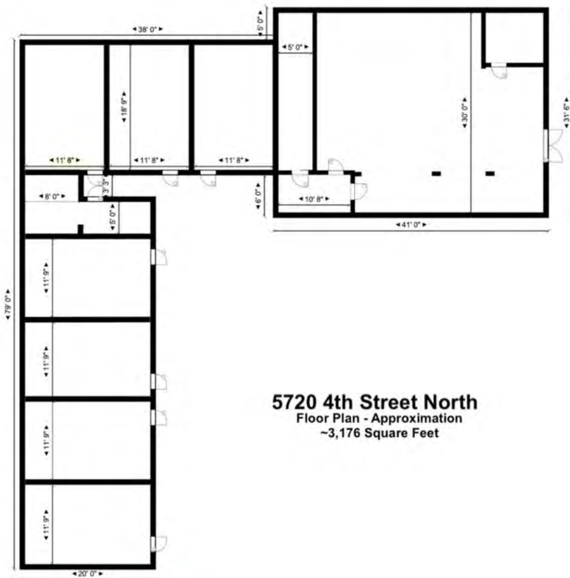
5720 4th Street North Floor Plan - Approximation ~3,176 Square Feet