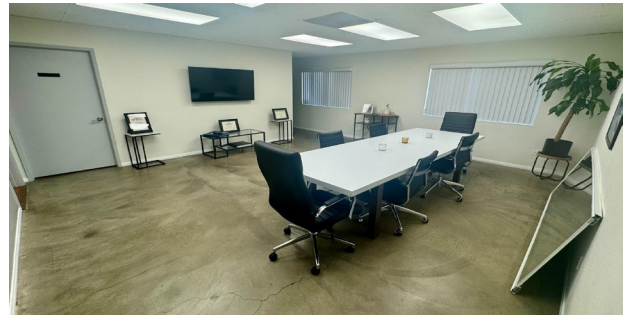
±2,600 SF Fully Remodeled Office Building