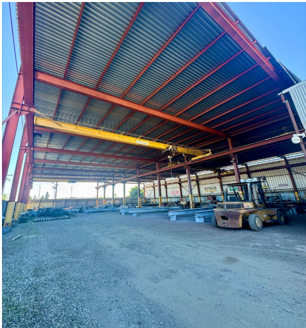
±20,000 SF Covered Crane Area