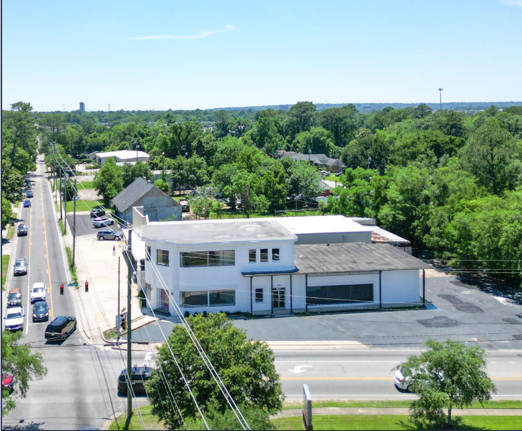
View from Cottage Hill Rd