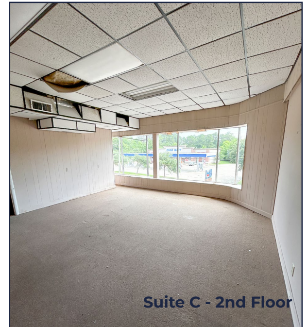
Suite C - 2nd Floor