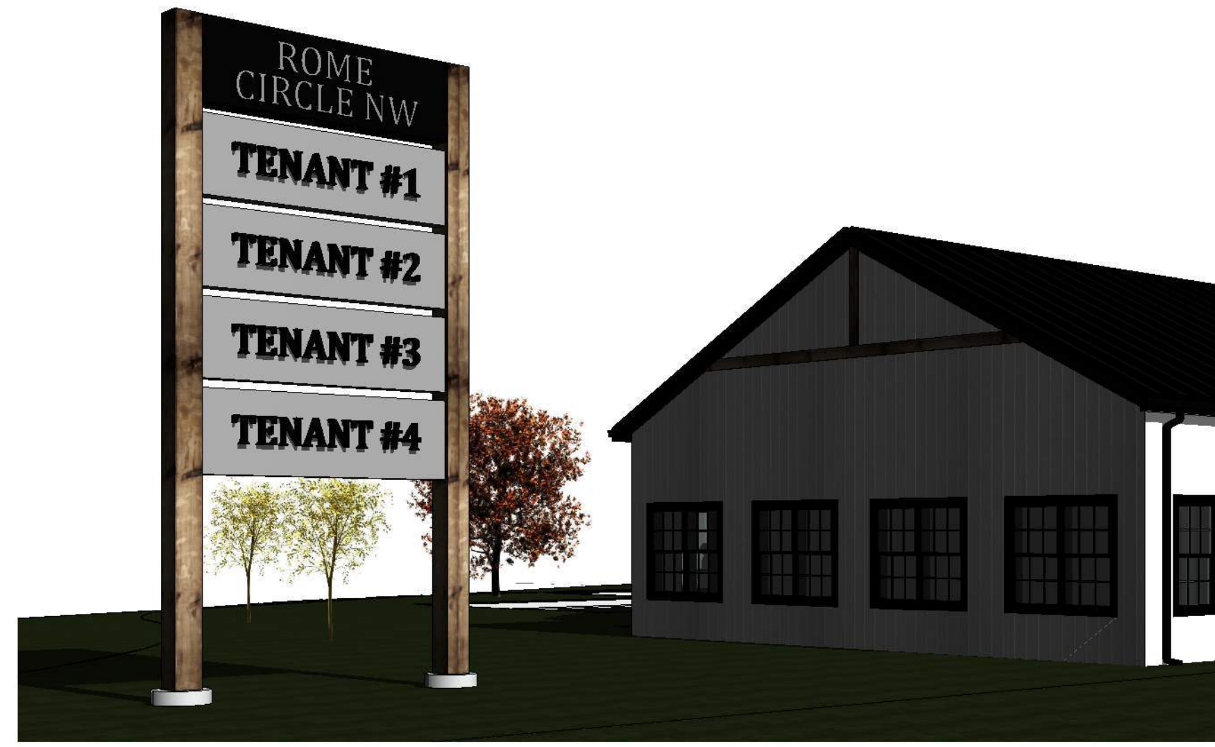
3 3D VIEW - HIGHWAY SIGN A1.1