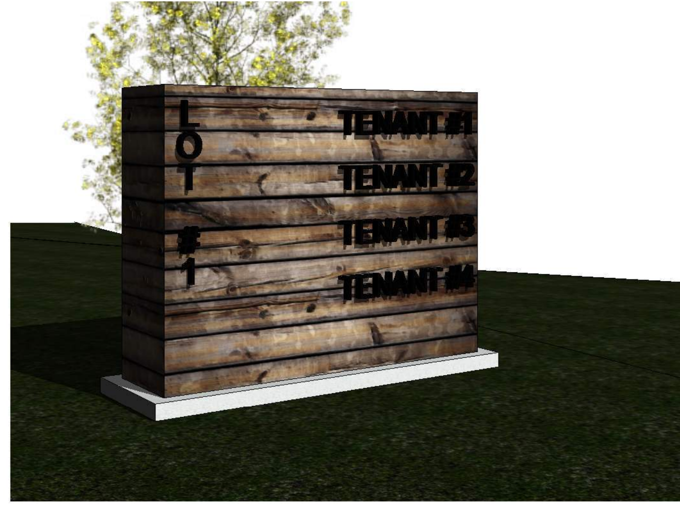
2 3D VIEW - STREET SIGN A1.1