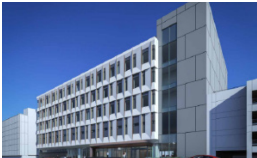
Rendering of the future cancer center