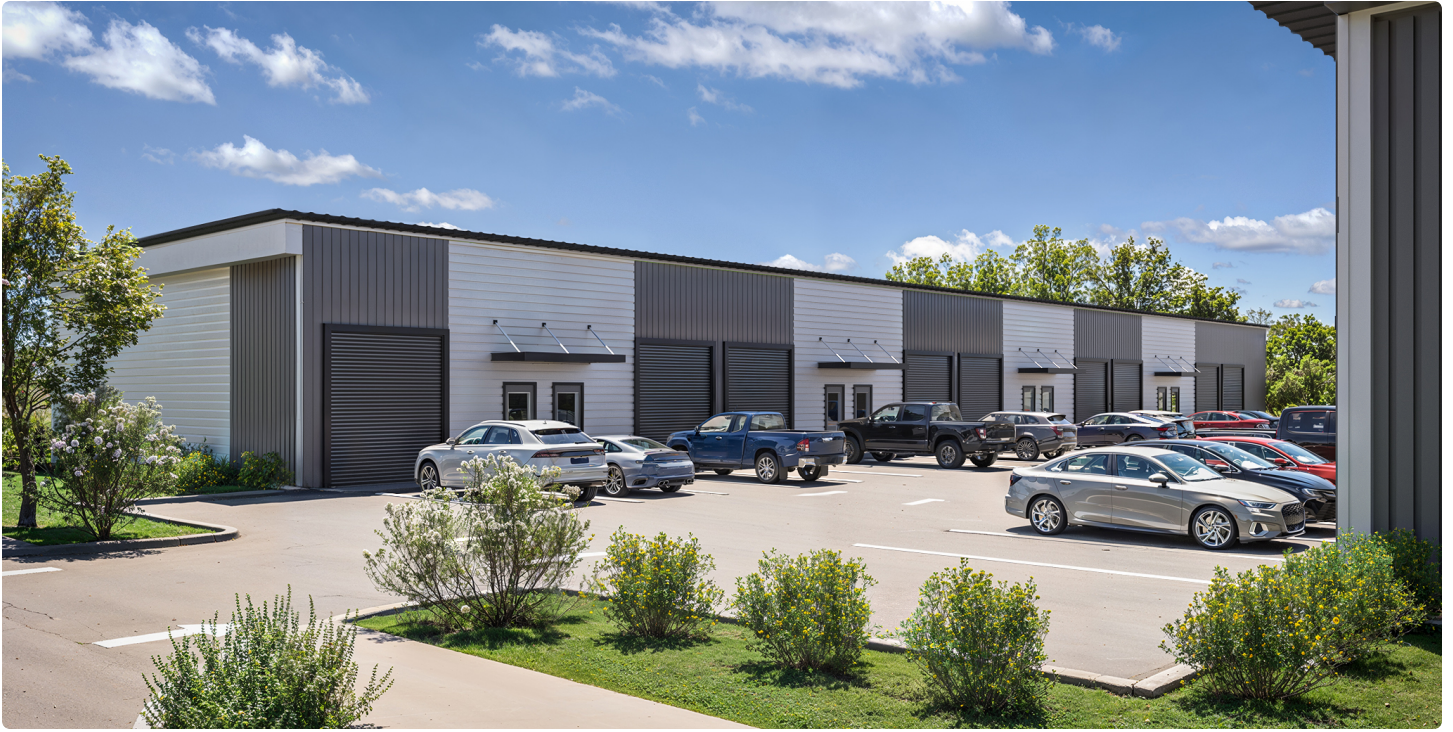
Exterior Rendering — New Construction

Hercules Business Park · 0 Hercules Ave, Houston, TX 77058