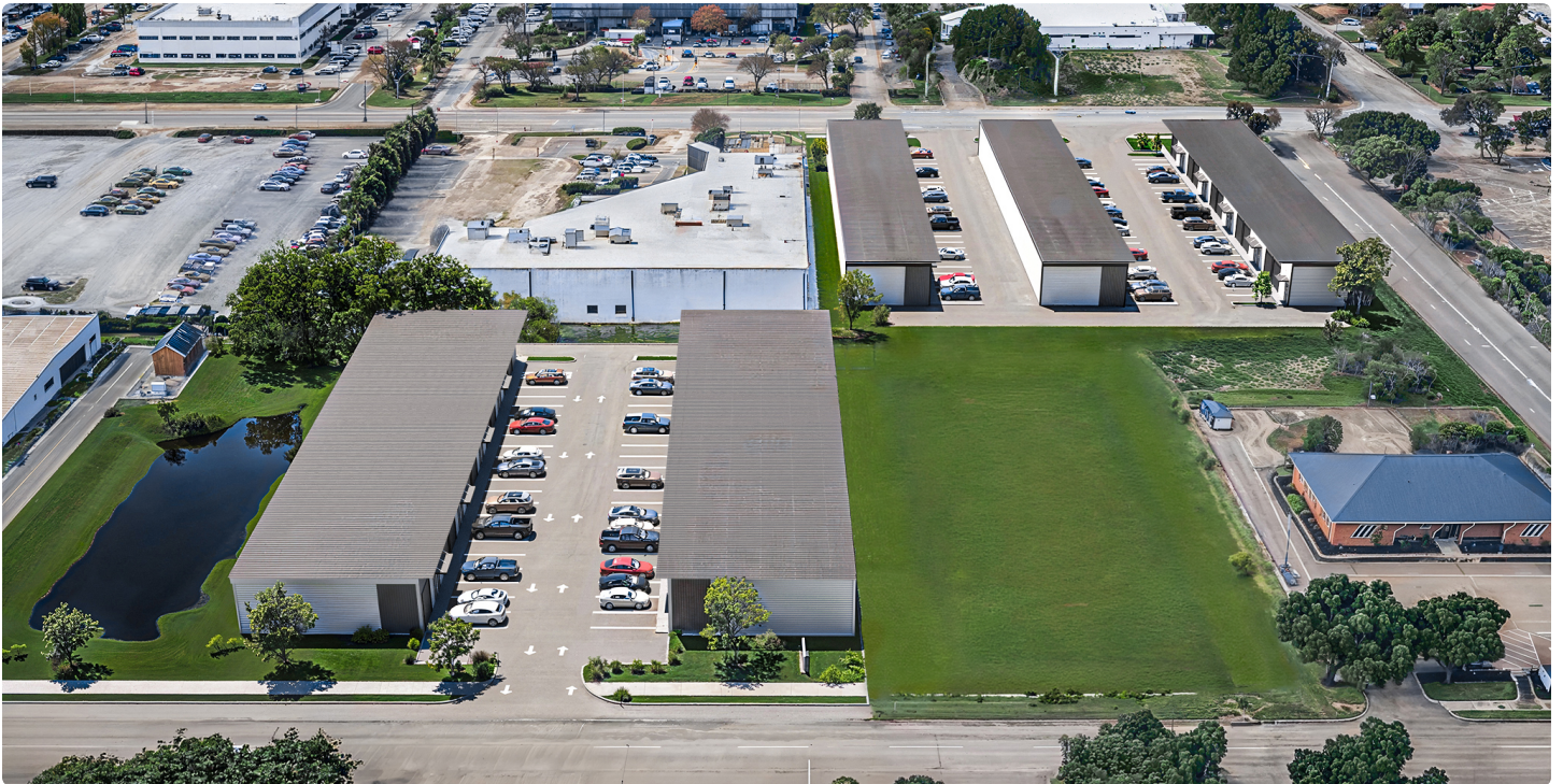
Aerial View — Development Site at 0 Hercules Ave