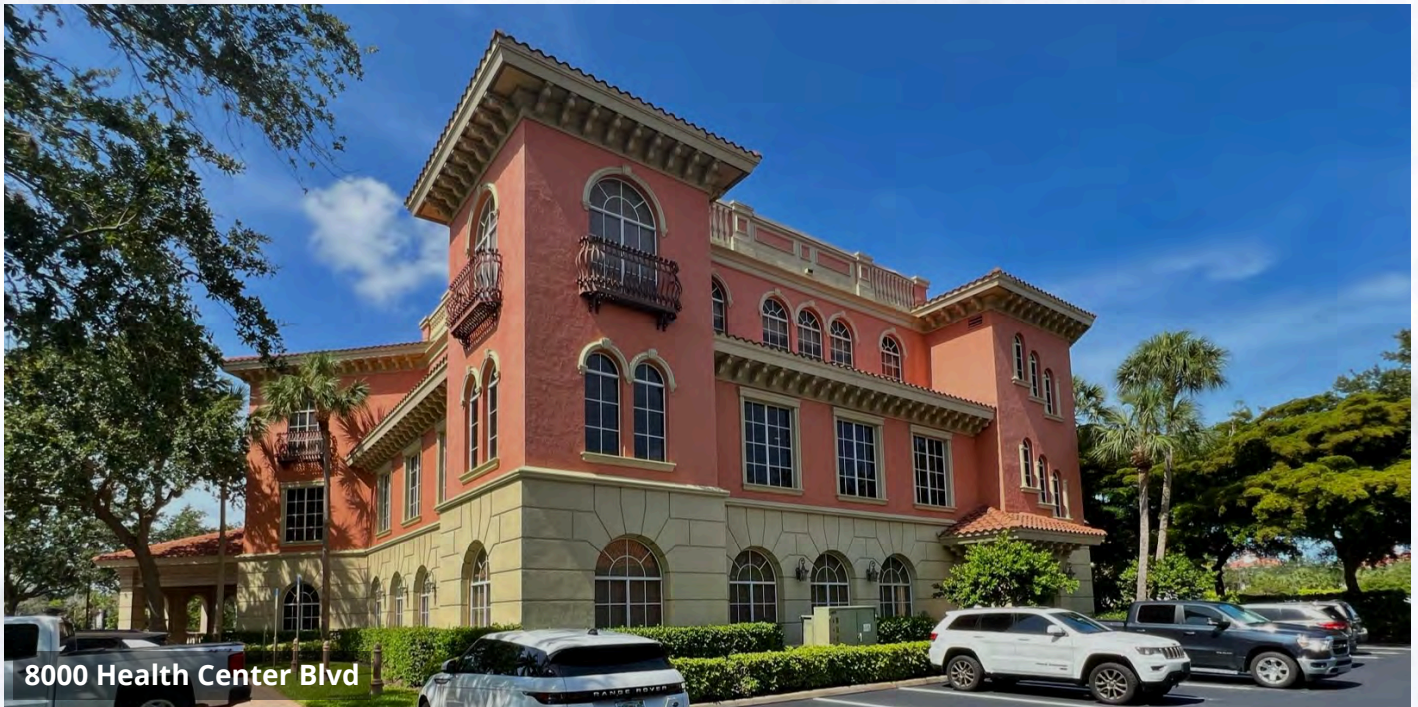
8000 Health Center Blvd

8000-8200 Health Center Blvd | Bonita Springs, FL.34135