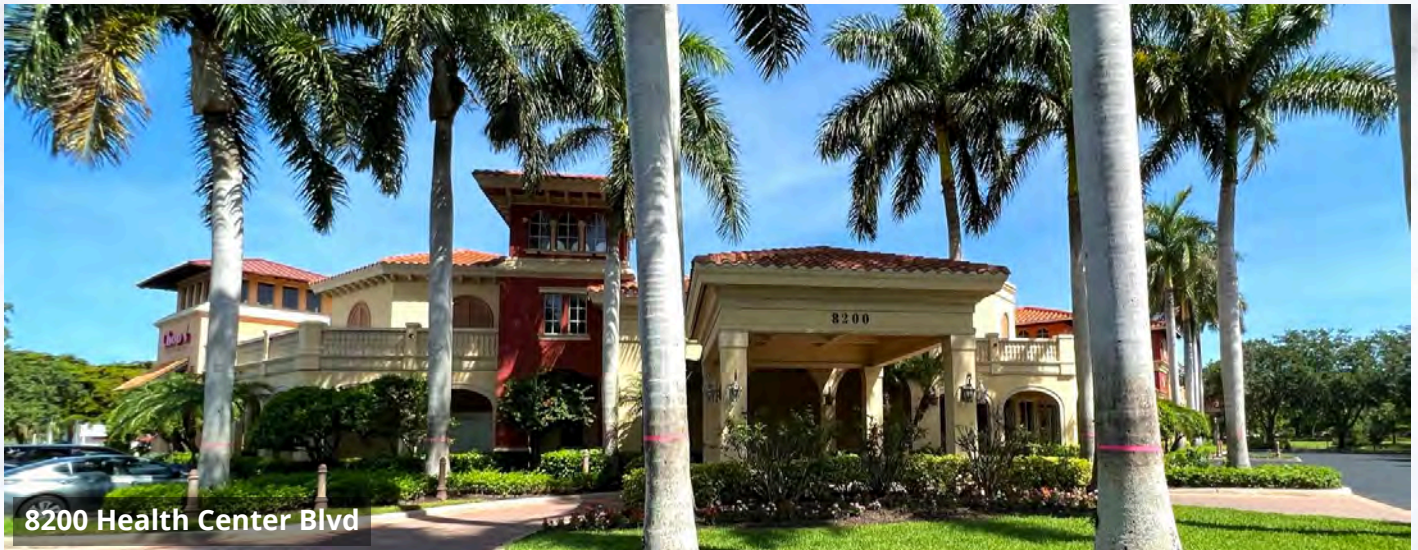
8200 Health Center Blvd