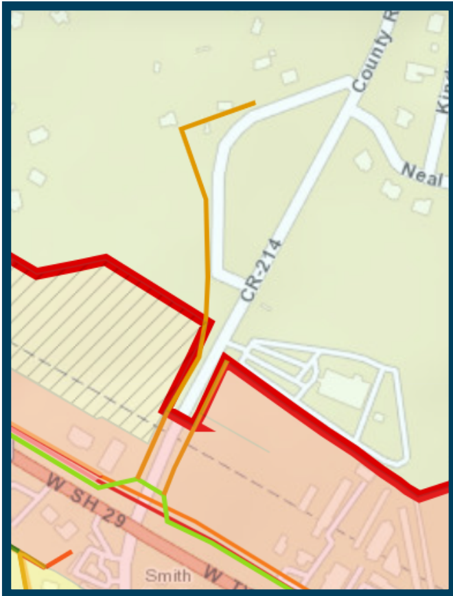
Liberty Hill Existing Water Line