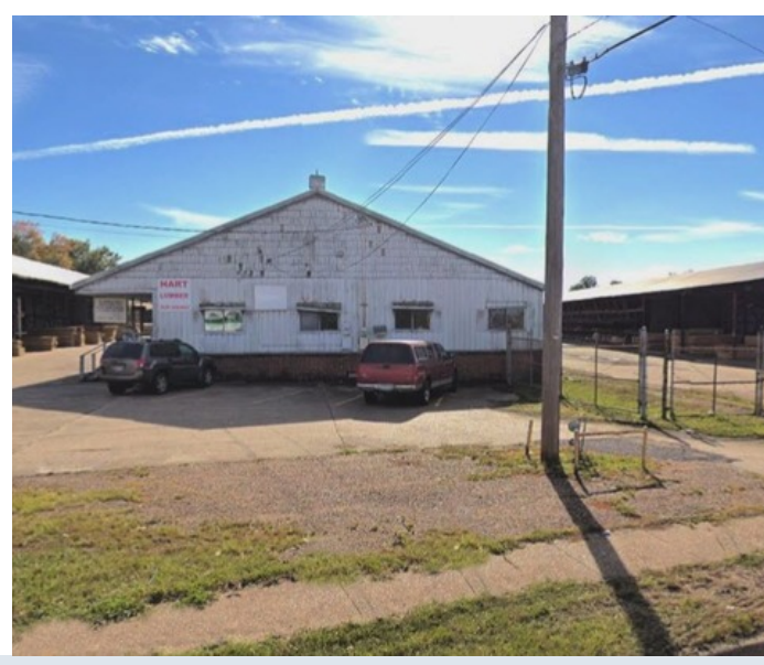
Sealy Real Estate Services, LLC 333 Texas Street, Suite 1050 Shreveport, LA 71101