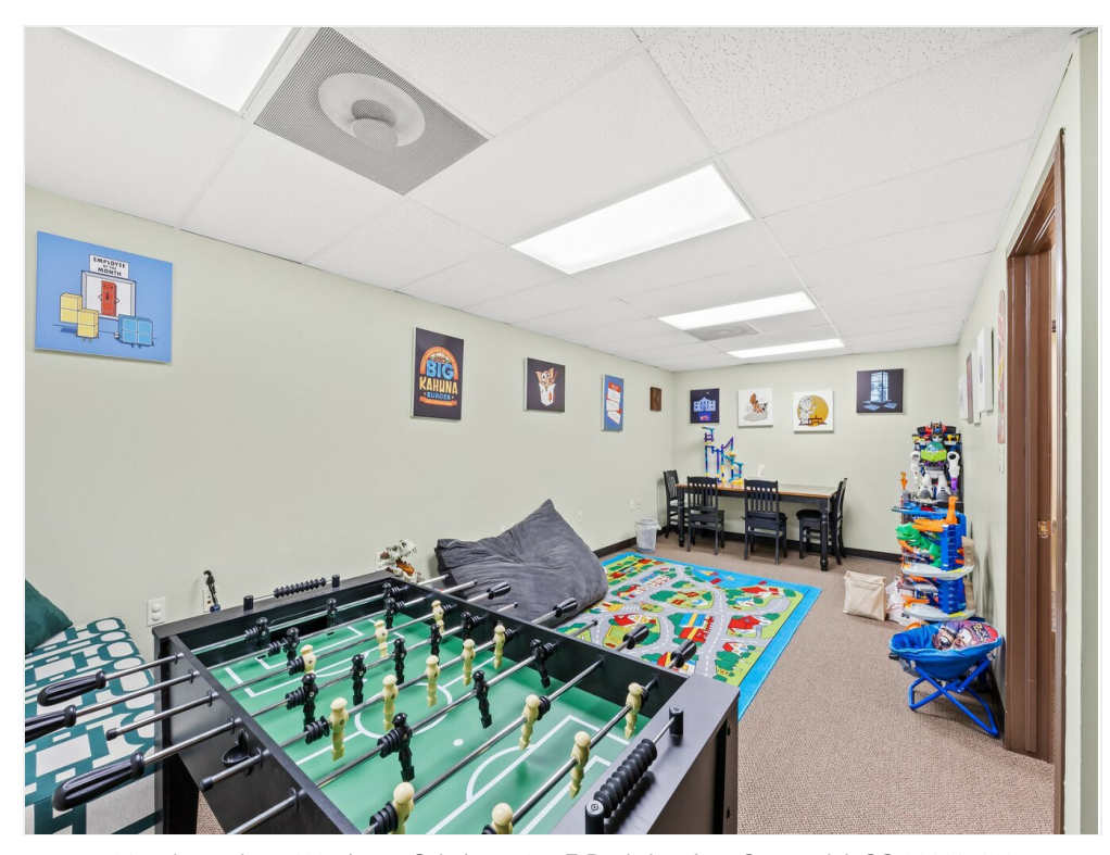
21-web-or-mls-#5429 - Laura Scholtz - 7435 E Peakview Ave, Centennial, CO 80111_118