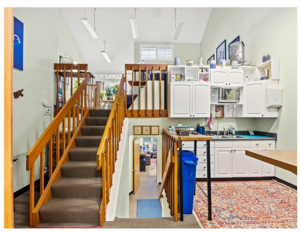
10-web-or-mls-#5429 - Laura Scholtz - 7435 E Peakview Ave, Centennial, CO 80111_107