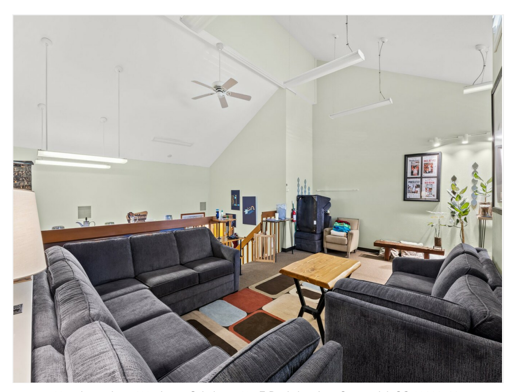
20-web-or-mls-#5429 - Laura Scholtz - 7435 E Peakview Ave, Centennial, CO 80111_117