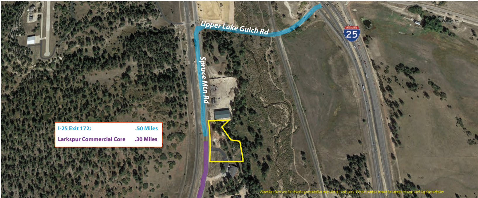
Boundary lines are for visual representation only and are not exact. Please contact broker for county records and legal description.