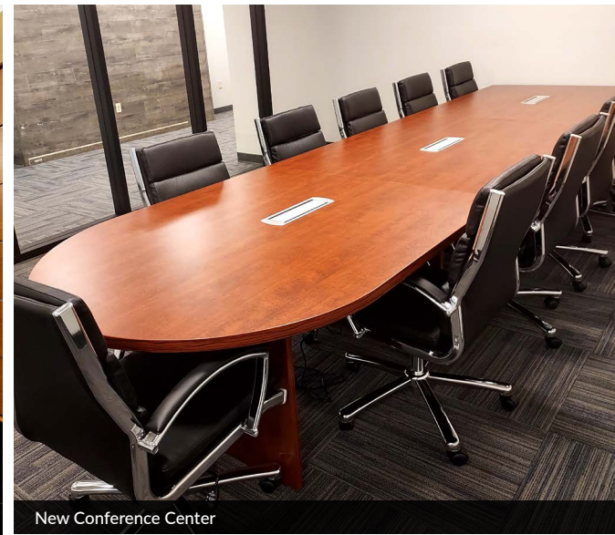
New Conference Center