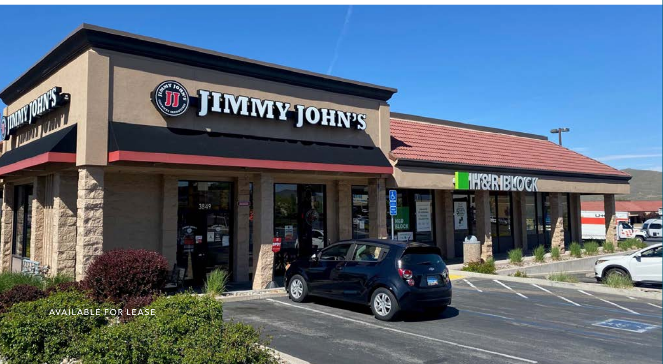
AVAILABLE FOR LEASE