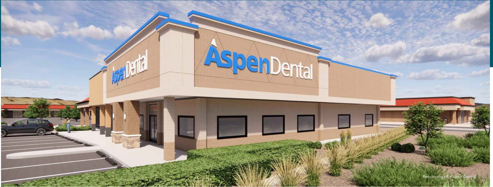
Rendering of Aspen Dental