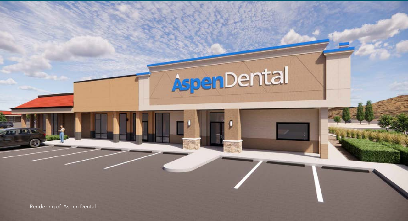
Rendering of Aspen Dental