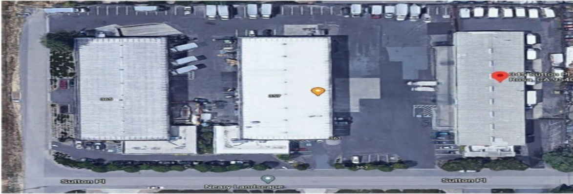
Exhibit A – The Project