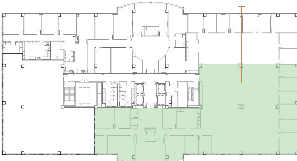
SUITE 601 9,784 SF