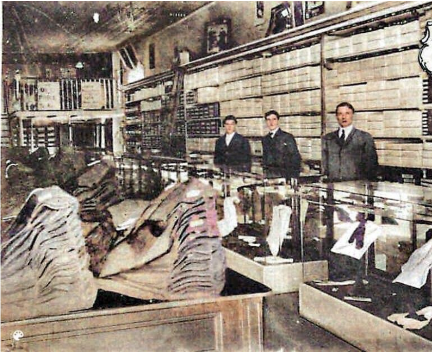
Wood-Bailey Clothing Company, circa 1907.