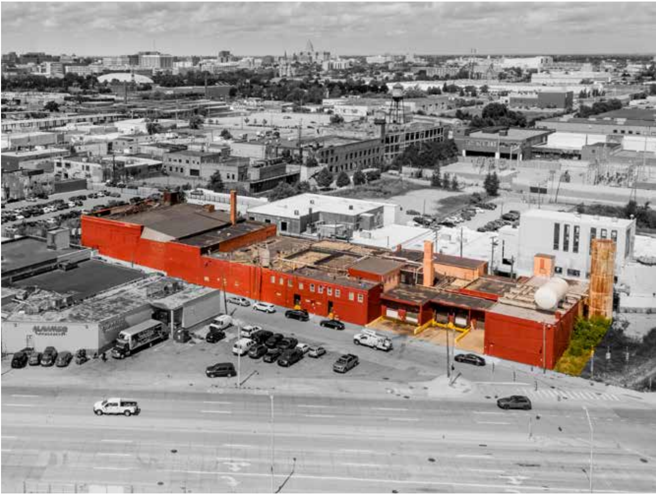
[CLOCKWISE FROM ABOVE] VIEW FROM GRATIOT AND DEQUINDRE CUT, VIEW FROM DEQUINDRE CUT, AND PARCEL OUTLINE