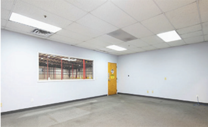
Photos of the property.

108-135 Summer Court, Georgetown, Kentucky