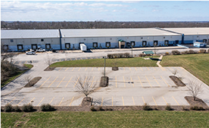
Photos of the property.

108-135 Summer Court, Georgetown, Kentucky