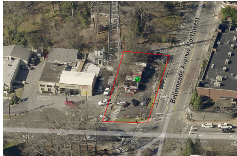
The subject property is the far right parcel fronting Northside Dr located on the corner of Bellemeade Ave & Northside Dr.