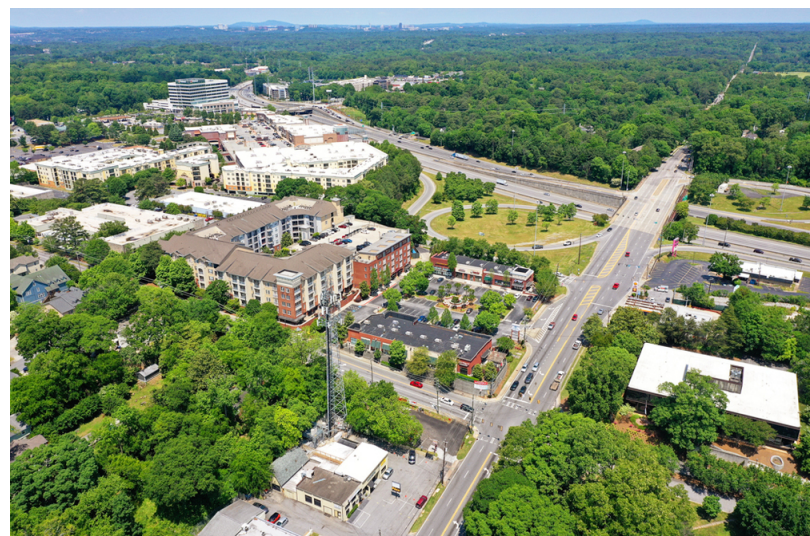
View looking north towards the I-75/Northside Drive Interchange.