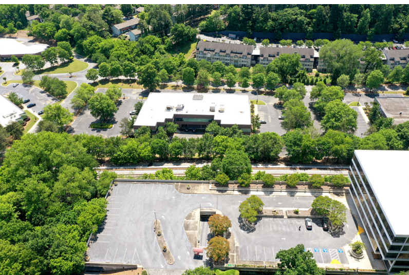
Site of proposed light rail station across Northside Drive from the subject.