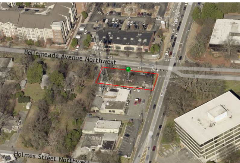
View of the site looking north on Northside Drive.