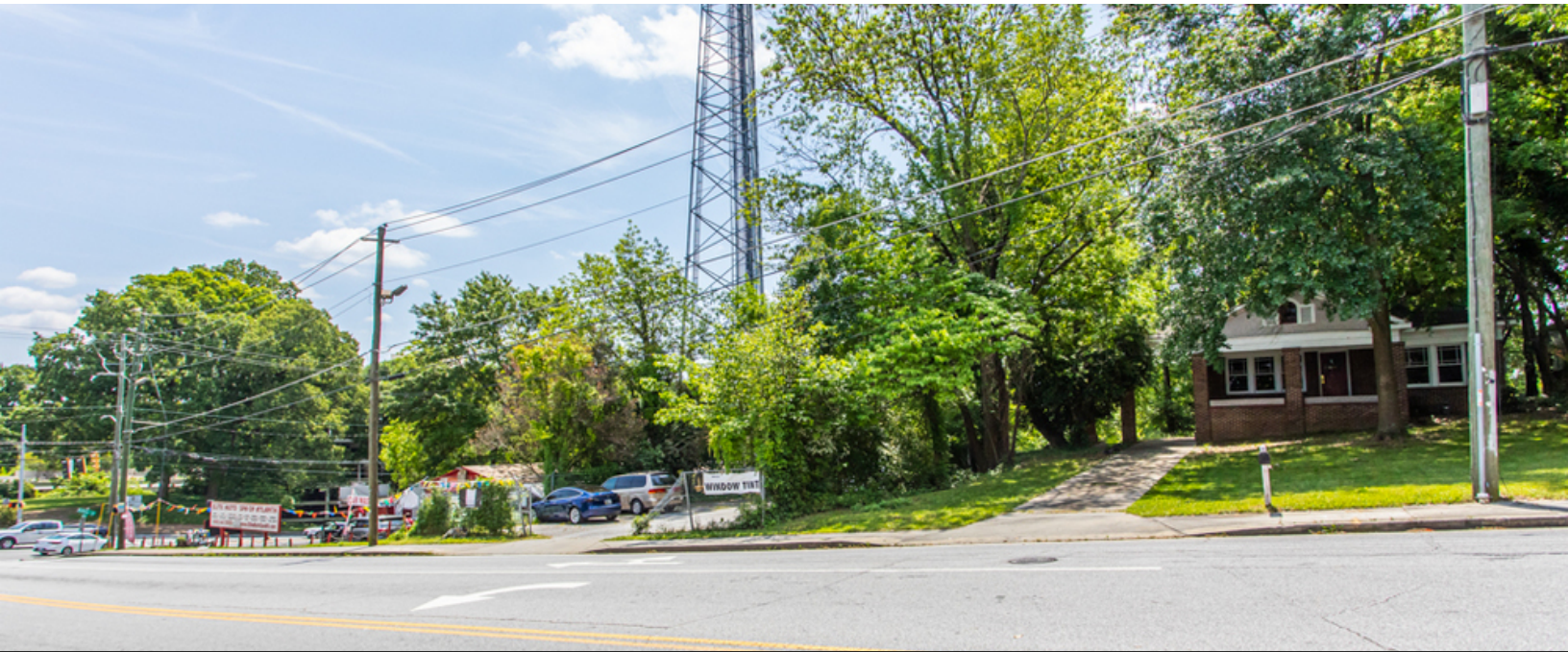
Bellemeade Avenue frontage

NORTHSIDE DRIVE DEVELOPMENT SITE | 1650 NORTHSIDE DRIVE, ATLANTA, GA 30318