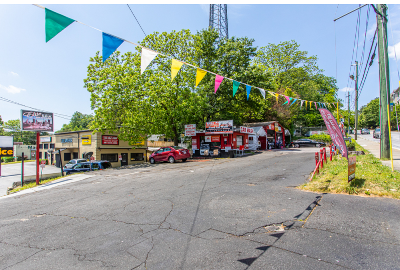
Corner of Bellemeade Avenue & Northside Drive