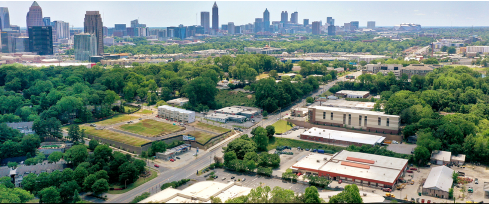
Aerial view from the site looking south to Midtown and Downtown Atlanta.

NORTHSIDE DRIVE DEVELOPMENT SITE | 1650 NORTHSIDE DRIVE, ATLANTA, GA 30318