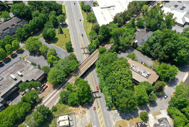
View of future Atlanta Beltline right of way crossing Northside Drive. The subject property is in the bottom right corner.

NORTHSIDE DRIVE DEVELOPMENT SITE | 1650 NORTHSIDE DRIVE, ATLANTA, GA 30318