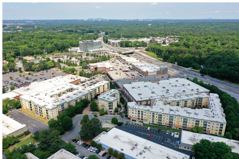
View of Walmart Center and nearby multifamily projects.