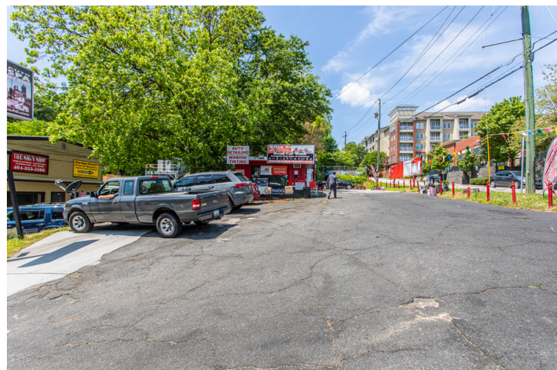
Northside Drive frontage