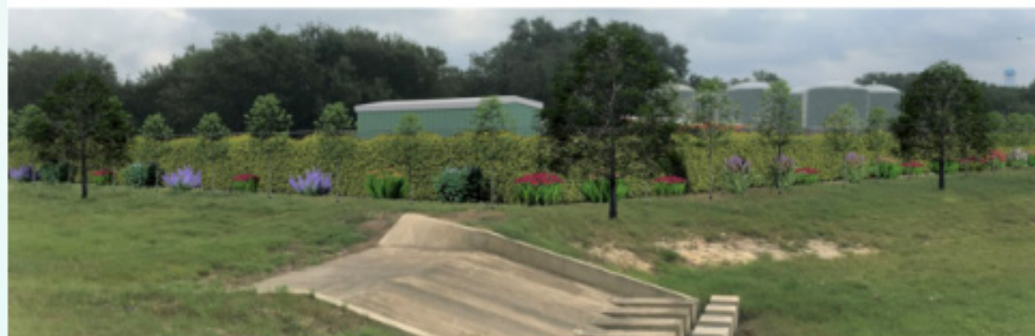
Artist Rendering of Plant Expansion

It has been announced that the next phase of expansion for the FGU Water Resource Recovery Facility (WRRF) has now broken ground and is in target for completion by the end of 2022. The new WRRF will be located directly adjacent to the existing plant, on the northeast side of the facility, continuing to serve customers throughout the Potranco Ranch, Potranco Oaks, and The Enclave at Potranco Oaks communities.