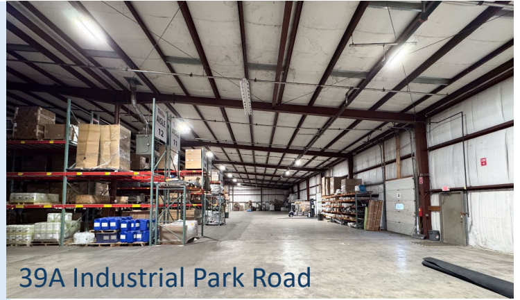
39A Industrial Park Road