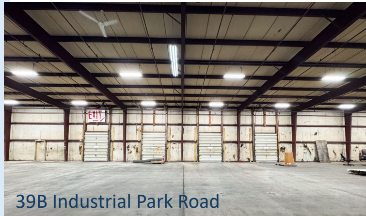
39B Industrial Park Road