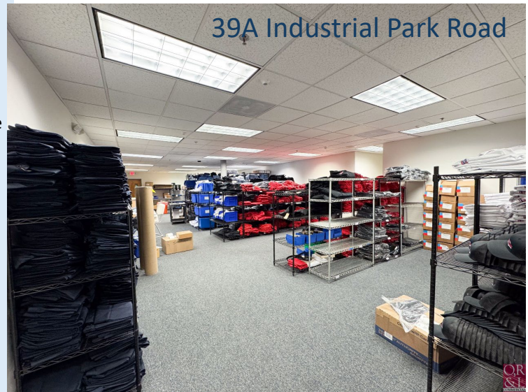
39A Industrial Park Road