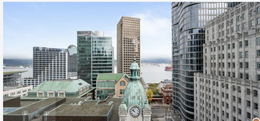
VIEWS FROM SUITE 1300