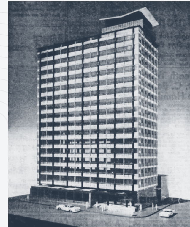
START WILL BE MADE SOON on 16-storey office building on site of old Williams Block, now in process of demolition, at southwest corner of Granville and Hastings. Building to cost $2,400,000, is owned by United Kingdom Properties Ltd.