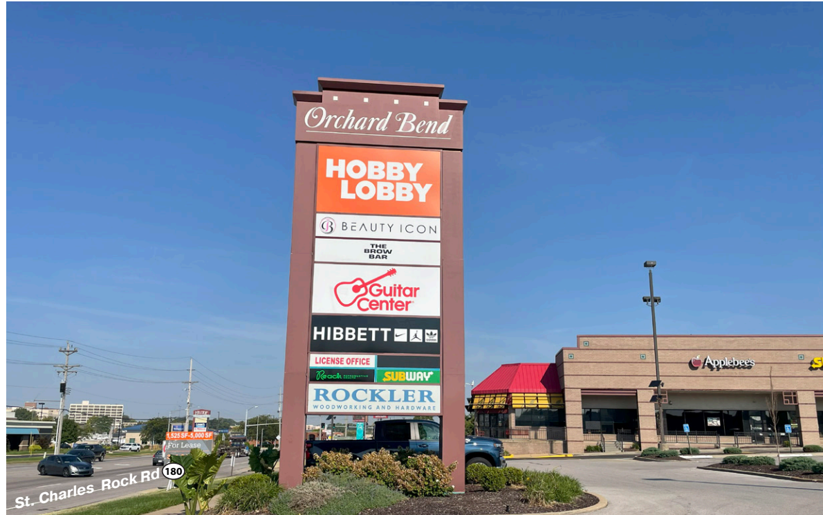
Monument Signage Highly Visible From St. Charles Rock Rd/I-70