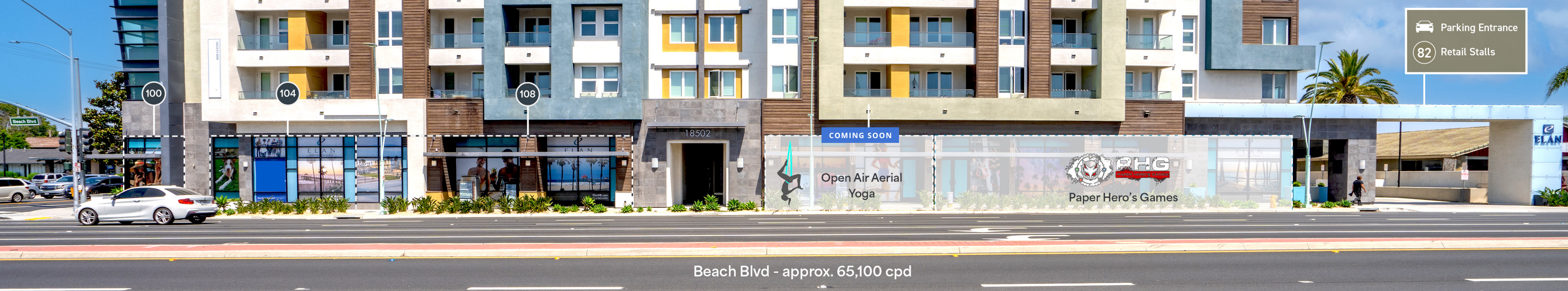
Beach Blvd - approx. 65,100 cpd