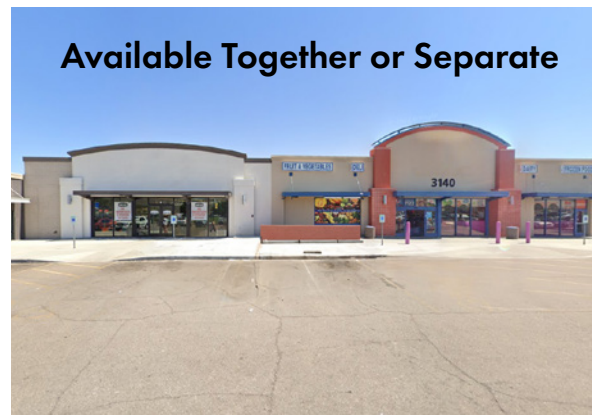
Available Together or Separate