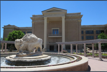
West Texas A&M – Canyon (10,000 students)