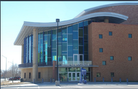
Globe Center for Performing Arts