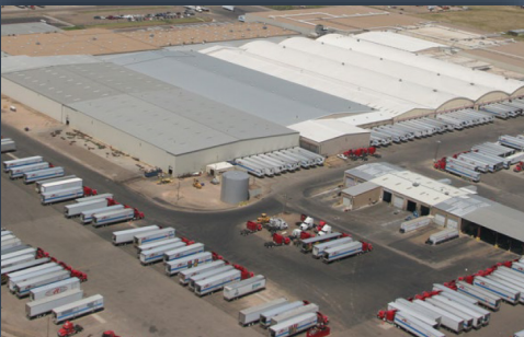
Major Industrial Developments