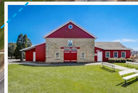
STABLE GRILL | CASUAL DINING