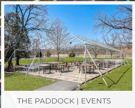
THE PADDOCK | EVENTS