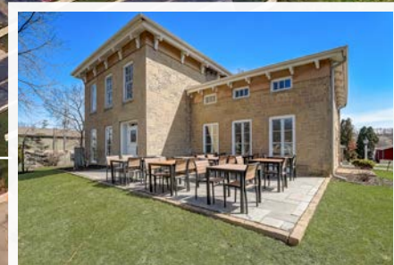
STONE HOUSE | FINE DINING