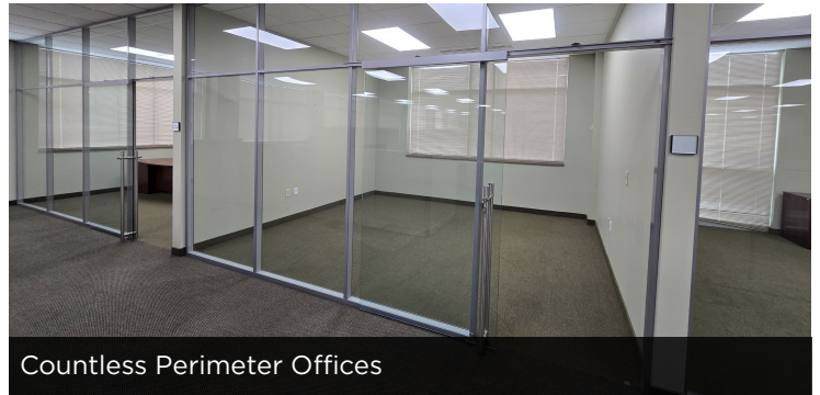
Countless Perimeter Offices