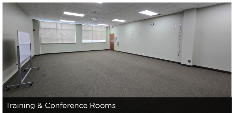
Training & Conference Rooms

AARON DAVIS O: 330.221.7297 aaron.davis@svn.com