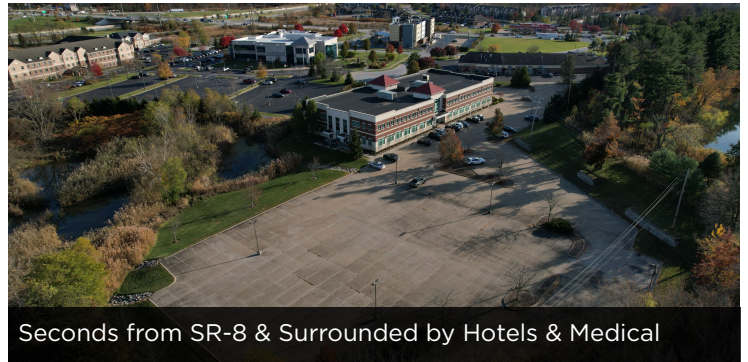
Seconds from SR-8 & Surrounded by Hotels & Medical