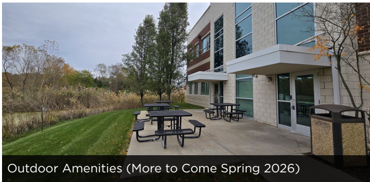
Outdoor Amenities (More to Come Spring 2026)