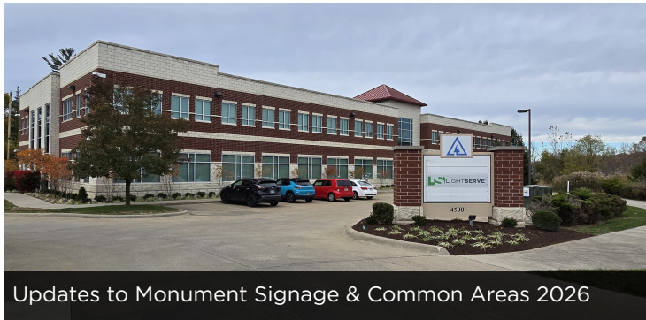
Updates to Monument Signage & Common Areas 2026