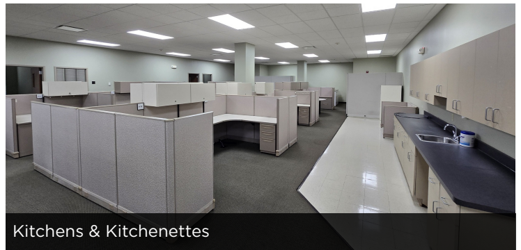
Kitchens & Kitchenettes