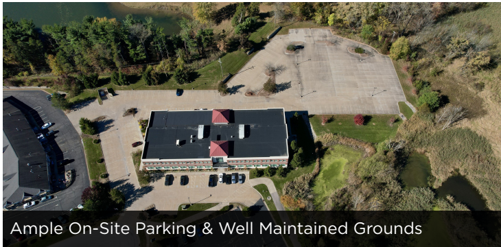
Ample On-Site Parking & Well Maintained Grounds