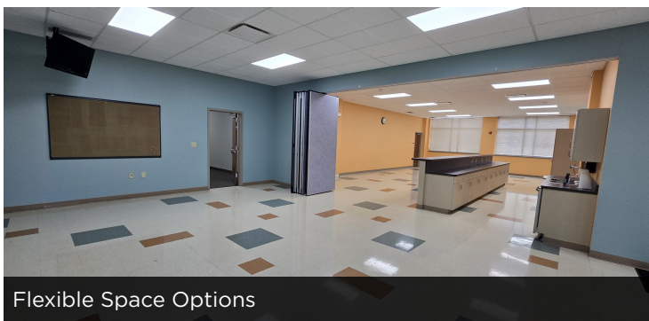
Flexible Space Options